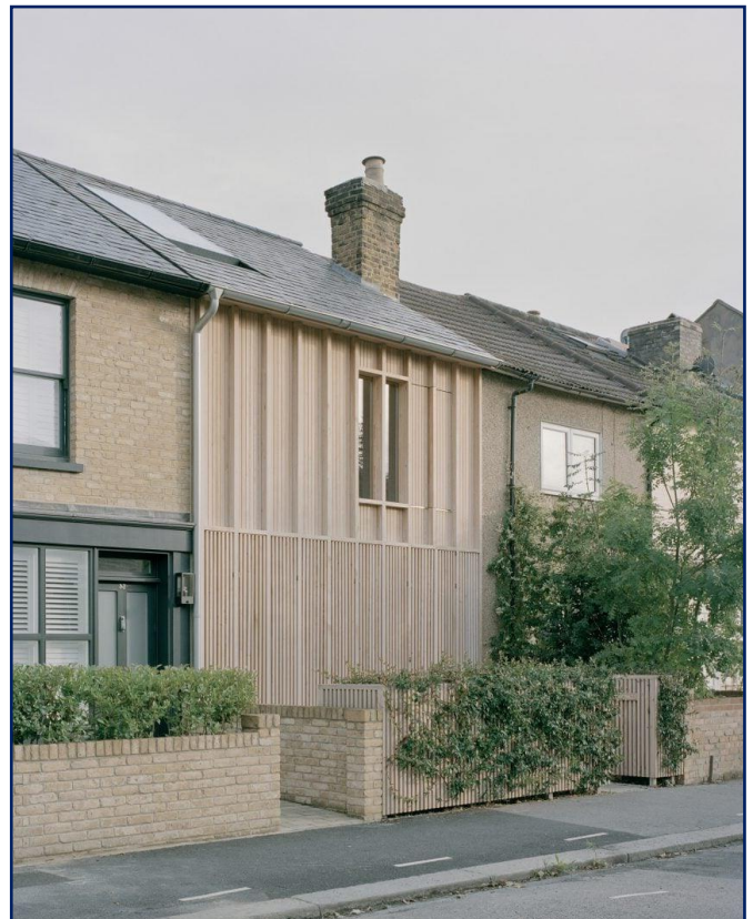
Spruce House by architects ao-ft is located in a conservation area in Walthamstow, London. The house is built with cross laminated timber.

The HSE’s warning relates to lightweight concrete planks and panels used primarily in structural applications for flat roofing, floors and walls between the 1950s and mid-1990s. It must be stressed that these aerated