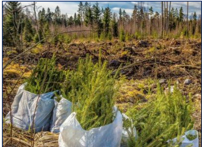
Spruce plantation harvesting and replanting in the lower St. Lawrence, Québec.

"Not only have these buildings advanced mass timber technology, they have also raised awareness of the benefits of timber construction across all housing types. This build method brings efficiencies and cost savings to self-builders and developers, and more importantly, it is absolutely the right way forward for the future of our planet."