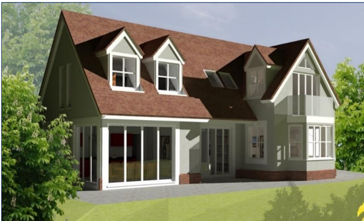
Self-build project, design phase

Building with timber also makes the best use of the material's natural thermal, acoustic and aesthetic properties, as well as its ability to withstand lateral loads such as high winds and earthquake-related forces without distorting or breaking.