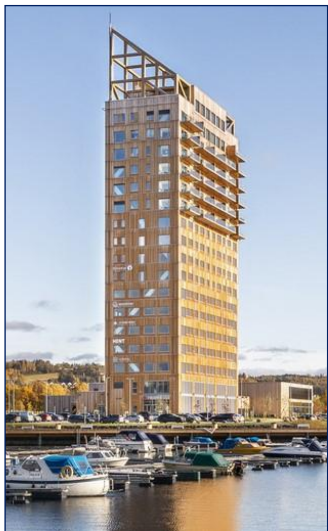
Mjøstårnet in Brumunddal, Norway, a symbol of the 'green shift'.