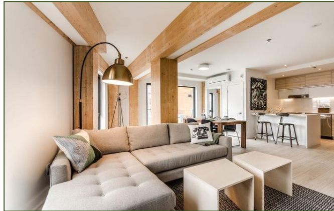
Interior with exposed timber elements at Arbora, a multi-family project in Montréal's Griffintown.

While architects compete to design the world's tallest timber tower, including Danish studio Schmidt Hammer Lassen's proposed 100-metre housing block in Switzerland, timber technology is also gaining traction in the residential market.